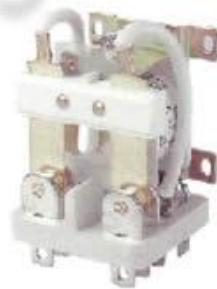
Dimensions and Mounting